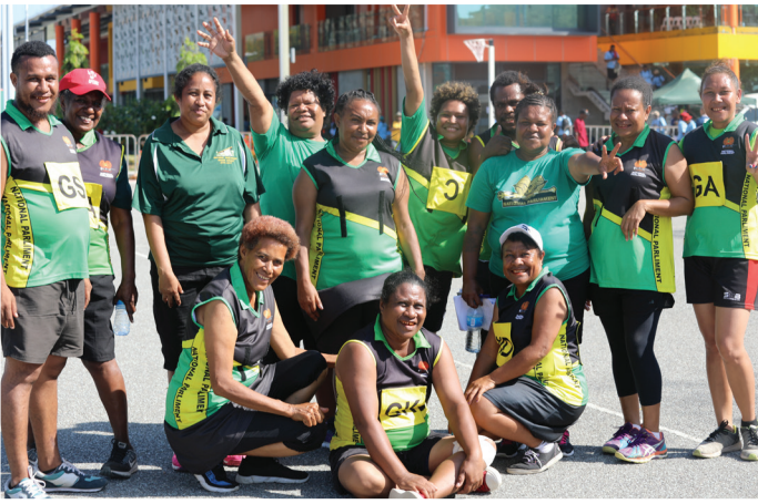
THE NATIONAL Parliamentary Service (NPS) Mixed Netball Team captured after one of their matches during the one-day sports program held at the Rita Flynn Netball Courts in November last year.