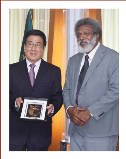
HEAD OF delegation Lin Duo, receiving a gift from the Speaker of Parliament Hon. Job Pomat, MP, GMG, during their visit to Parliament House.

A DELEGATION of Chinese officials from the Communist Party of China (CPC) paid a courtesy visit to the Speaker of Parliament Hon. Job Pomat, MP, GMG last November. The team was led by Lin Duo, a member of the Central Committee of CPC and Secretary of the Gansu Provincial Party. The team was in the country meeting with the Department of Foreign Affairs to strengthen good relations between the two countries and visited the Speaker to promote party to party exchange programs between the two parliaments.