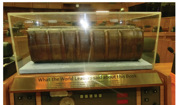
WHAT WORLD LEADERS SAID ABOUT THIS BOOK | "It is impossible to rightly govern the world without God and the Bible." - George Washington, 1st US President, 1797. Pictured above is the 409 year old Bible kept in a glass box in Parliament House.