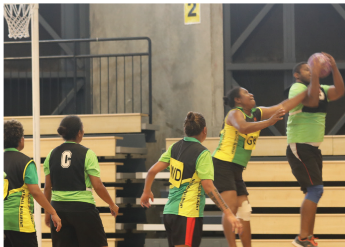
NPS netballers in defence mode. Unfortunately the team bowed out of the qualifying finals, losing to Internal Revenue Commission (IRC).