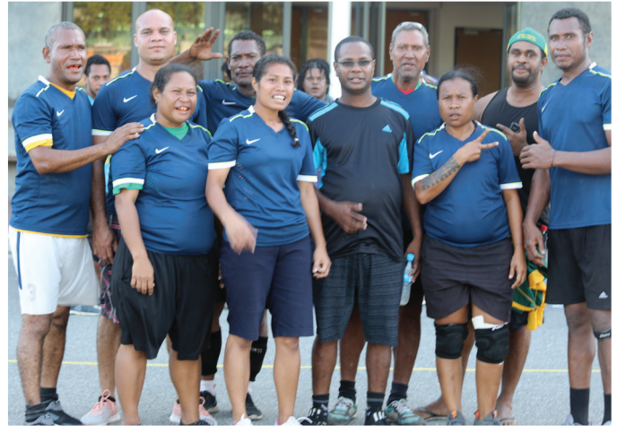
The NPS Volleyball "Dream Team", that won the grandfinal against Correctional Institution Services (CIS).