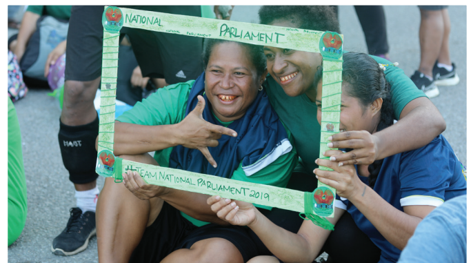
NPS staff enjoying the day.