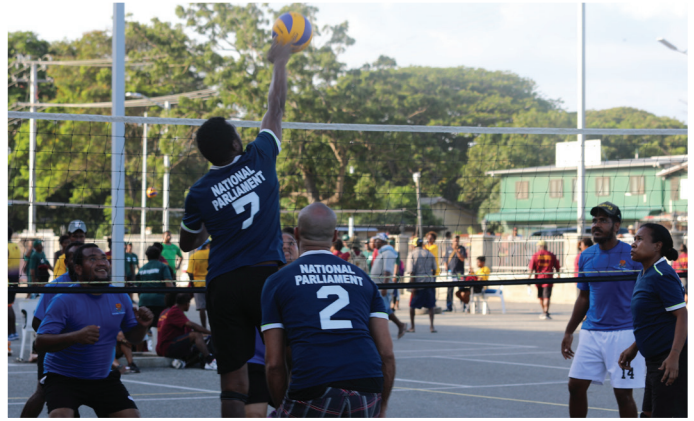
The NPS Mixed Volleyball Team in action during one of their matches.