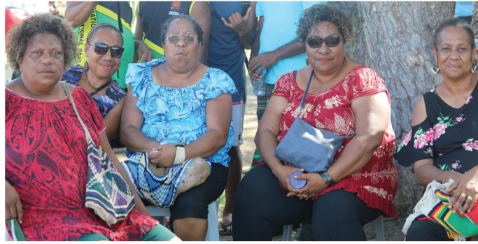
NPS staff supporting "Team Parliament" during the program which involved more than 30 Government departments and agencies taking part in netball, volleyball and soccer.