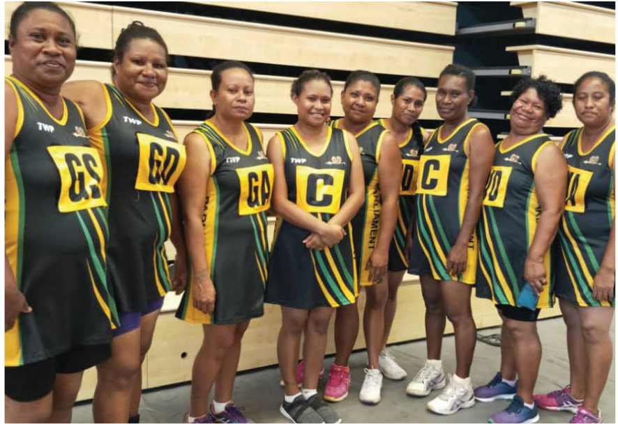
● ABOVE RIGHT | The National Parliamentary Service netball team in their new uniforms, taking time out for a team photo before one of their games during Round 2 of the Public Servants Netball competition held at the Rita Flynn Netball Courts.

THE two National Parliamentary Service (NPS) netball teams taking part in the Public Servants (PSNC) and Private Companies (PCNC) netball club competitions have secured a spot each in the preliminary finals, scheduled in February. Both teams made up of staff and dependents went on to play in the semi-finals in their respective divisions. When this publication went to print, the team in the PSNC competition bowed out of the competition and the team in the PCNC competition were preparing for the major semi-finals. The competitions were held every Saturday and Sunday respectively, at the Rita Flynn Netball Courts in Bisini, Boroko. Congratulations to both teams for their outstanding efforts as exceptional sportswomen and ambassadors of NPS.