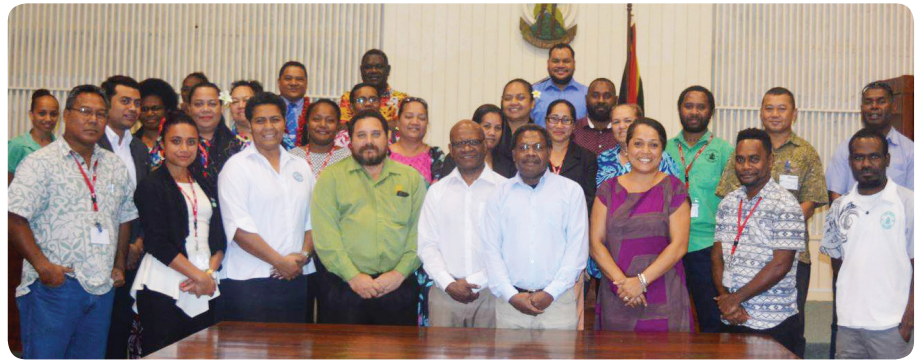
Participants of the program take a group photo.