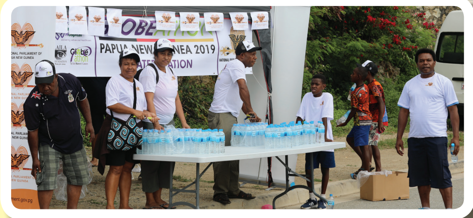
Staff at the National Parliament's water station, giving out water to participants.