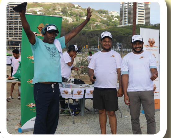
Some staff members at the event.