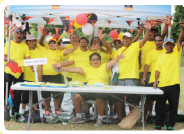
The Kapuls team members having a good time during the Staff Sports Day held in September to celebrate PNG's 44th Independence anniversary.