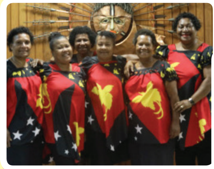
Female staff members wearing "PNG flag-themed" meri blouses during the week leading up to Independence Day anniversary.