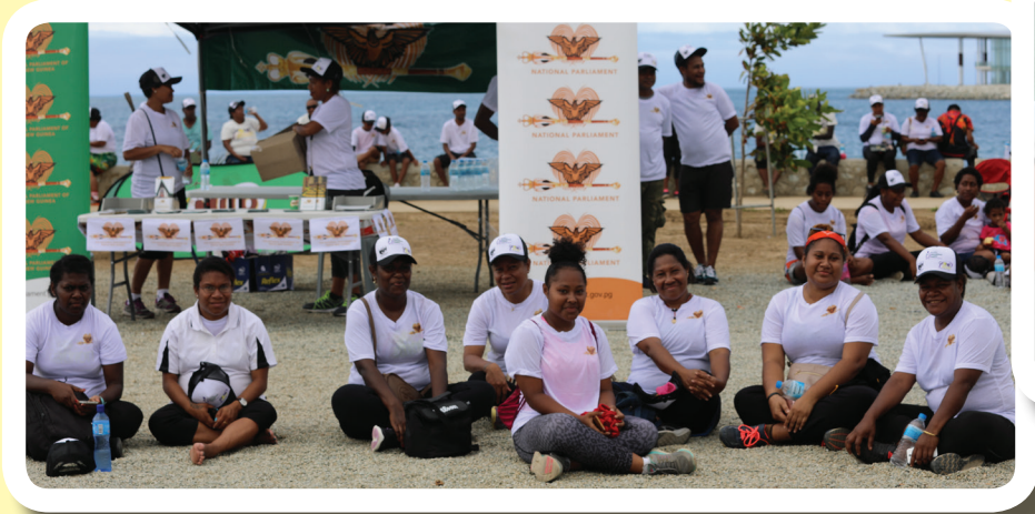
Staff members taking a breather after the walk in front of the information booth.