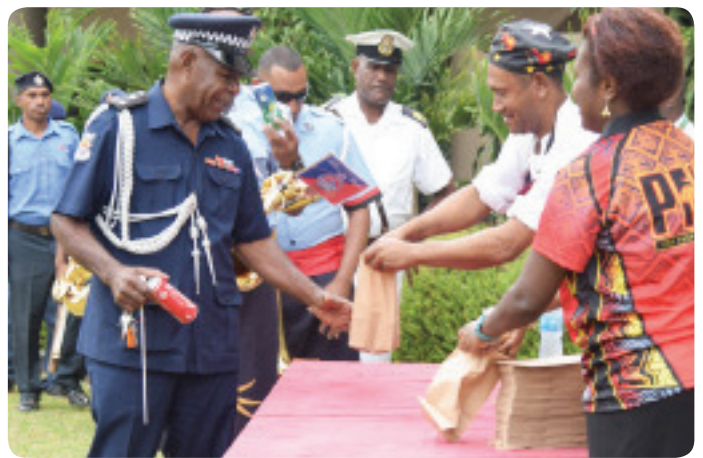
Catering staff serving police officers breakfast after the flag-raising ceremony.