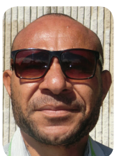
GROX SOHO Human Resource - Staff Clerk

Take back PNG is about taking back our inheritance and identity, stolen through corporate greed and bad management by our leaders. I come from Western Province that owns Ok Tedi mineral resources. However, my people are yet to see or receive any real benefit from the revenue generated from the mine, as the landowners get the least, that is two per cent of the share. It's about getting better recognition through better percentages and better services and development such as airports, roads, bridges, health centres and others.