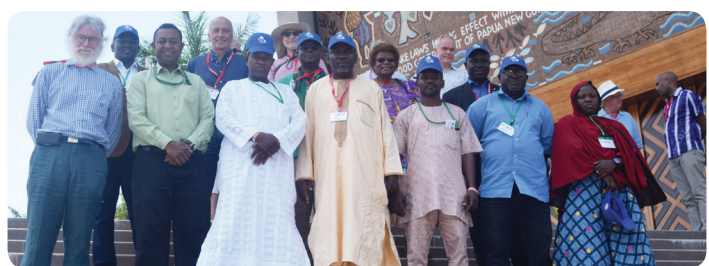
Registrars and magistrates from Commonwealth countries who were in Port Moresby in September for the 2019 Commonwealth Magistrates and Judges Association (CMJA) Conference visited the Parliament House as part of their official program. They are pictured here with staff from the Serjeant-At-Arms Division.