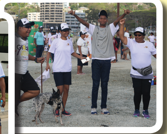
Staff and their families enjoying the day.