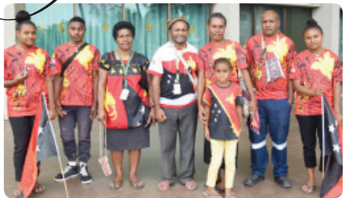
Staff members take a photo with their families after the flag-raising ceremony dressed in their Independence colours.