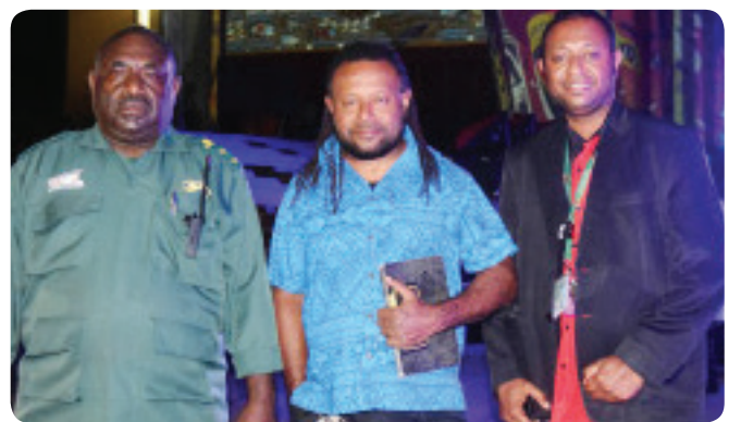
Staff at the Prime Minister's Independence dinner, take a quick photo with music icon Pati Potts Doi who was one of several popular local artists performing during the event.

“ ACCOUNTABILITY: At the end of the day we are accountable to ourselves ” - our success is a result of what we do. - Catherine Pulsifer