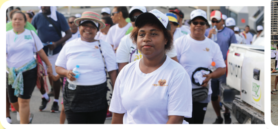
Staff with family members captured during the walk which started from Ela Beach to Downtown Port Moresby, around the Paga Ring Road then back to Ela Beach.