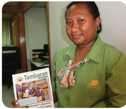
Pictured are staff members posing with the inaugural copy of the National Parliamentary Service's (NPS) first-ever internal publication, Tambaran Update launched in August this year.

THE National Parliamentary Service (NPS) now has an internal publication launched in August this year to highlight the work and activities of the service and is aimed at fostering consistent interaction and engagement between management and staff through information sharing.