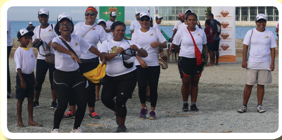
Staff members going through a warm-up session before the walk.

ABOUT 100 National Parliamentary Service (NPS) staff and their families captured at this year's Globeathon held on the last Sunday of September at Ela Beach. The event organised by Pacific International Hospital (PIH) is an annual walk that creates and supports awareness on cancers affecting women and focuses on the message of "early detection can save lives". NPS was one of the key sponsors for the event, which has been running for the past six years.