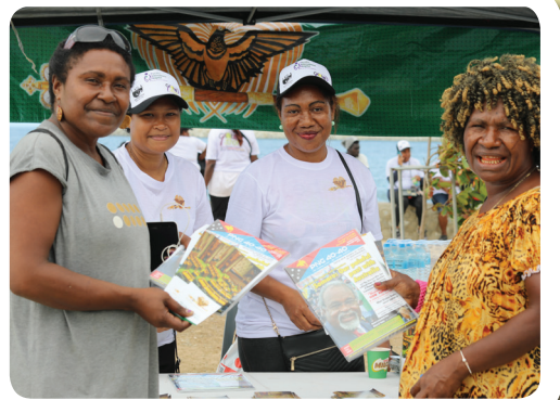
Open Parliament Program staff with two members of the public, sharing information about the National Parliament.