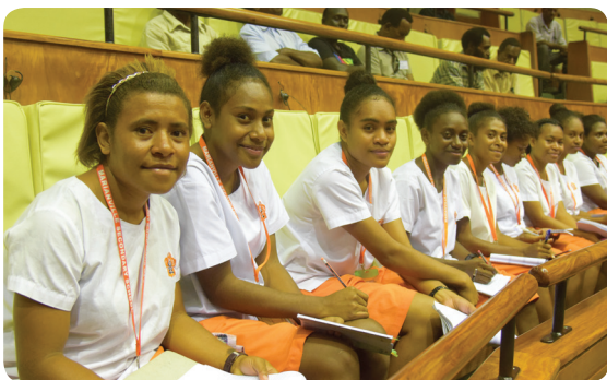
Marianville Secondary School students captured in the public gallery recently, attending a Parliament session.