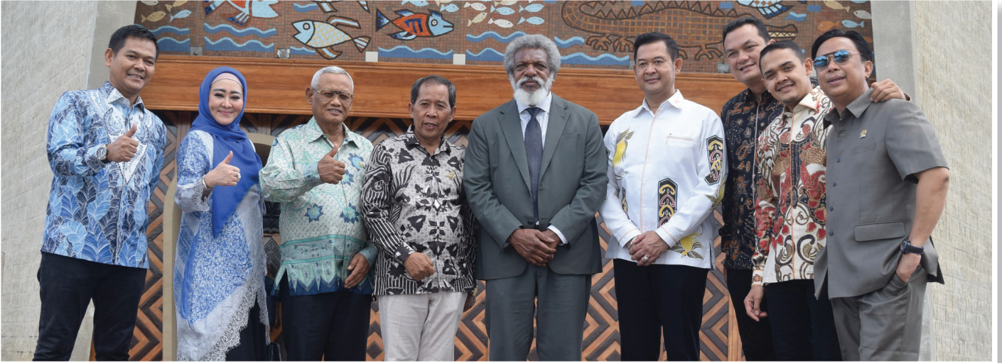
THE delegation take a group photo with the Speaker of Parliament Hon. Job Pomat, CMG, MP after a guided tour of Parliament House and its precincts.

A SEVEN-MEMBER parliamentary delegation from the Republic of Indonesia paid a courtesy visit to the Speaker of Parliament Hon. Job Poma, CMG, MP yesterday to strengthen bilateral relations and cooperation between the two