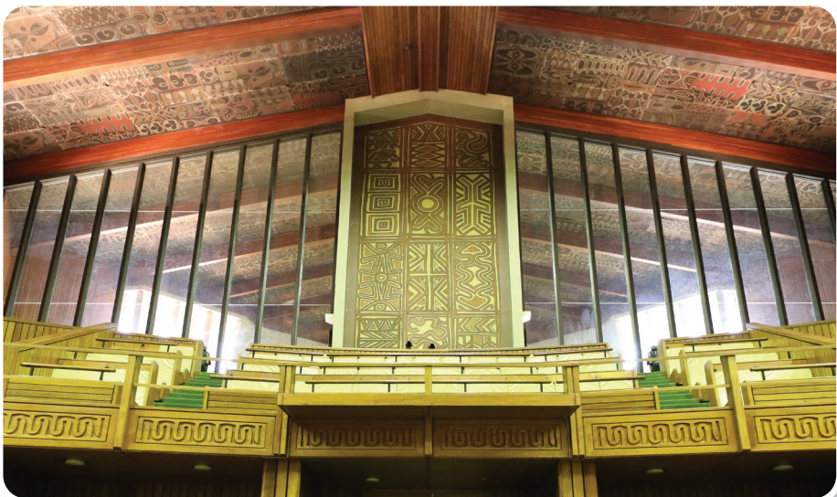
THE GALLERIES are seated areas in the Chamber of Parliament from which members of the public may watch the proceedings of Parliament. Apart from the Public Galleries, there is the Speaker's Gallery (pictured) which is located directly opposite the Speaker's Chair for his invited guests, members of the Diplomatic Corps and foreign dignitaries.