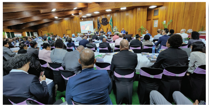
THE State Function Room packed to capacity during the 2023 Budget Lock-up.