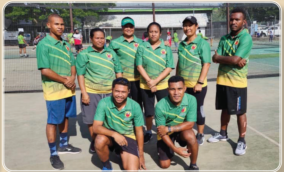
TEAM Parliament in the Port Moresby Corporate In-door Cricket competition geared to face their rivals during one of the matches. The teams are faring well securing themselves in the top 5 spots, respectively