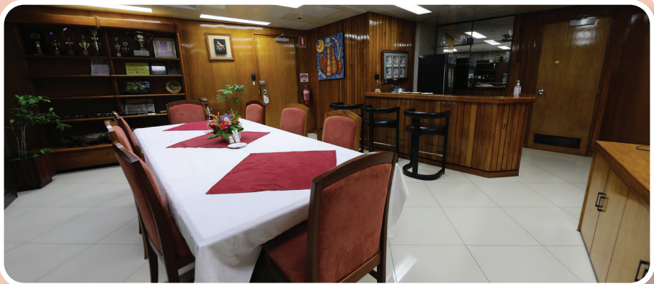
CLERK'S LOUNGE - PICTURED here is the Clerk's Lounge in the Office of the Clerk of Parliament where the Clerk as the administrative head of the Parliamentary Service conducts official business including meetings and ceremonies.