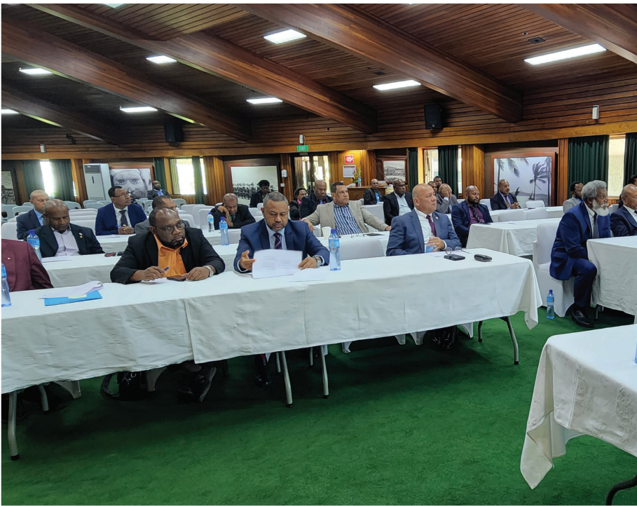
MEMBERS of Parliament attending the Induction and Swearing-in ceremony.

A SPECIAL Induction and Swearing-in ceremony for chairmen and members of Parliamentary Committees was held in November to launch the Work of Committees for this 11th Parliament.