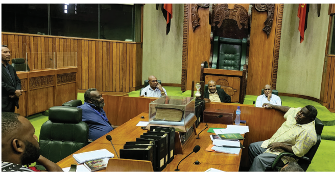
OFFICERS from Chamber Services with Assistant Speakers during a training session in the Chamber of Parliament.