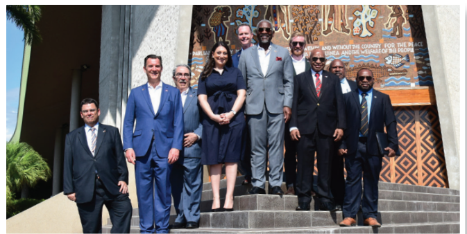
THE US Senate Delegation for Parliamentary Committees on Defence, Housing, Gender and Internal Security during their visit to Parliament.