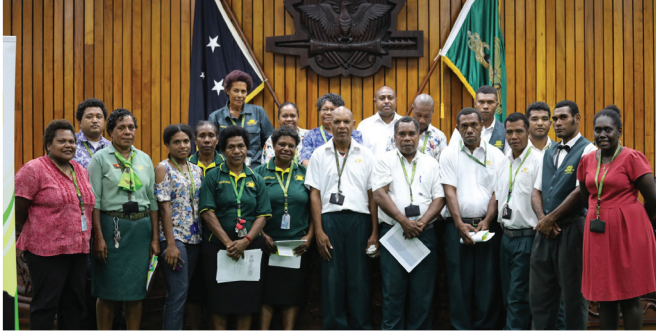
OFFICERS from Tisa Community Finance held an awareness session on its products and services for Parliamentary Service staff, at Parliament House