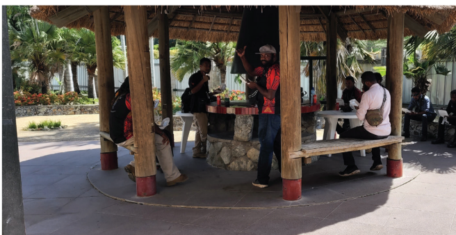
MAINSTREAM media personnel are pictured here taking a break for lunch at the C Block Poolside after the Budget session in November.