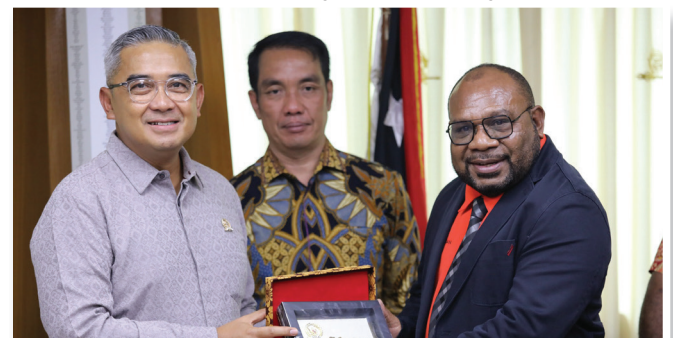
INDONESIAN parliamentarians present the Deputy Speaker Hon. Koni Iguan, MP, a gift during their courtesy visit in November.