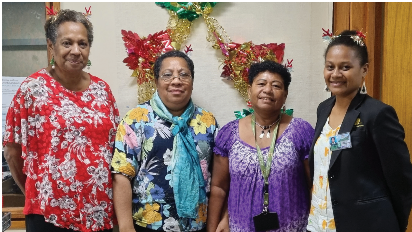
MERRY CHRISTMAS & A HAPPY NEW YEAR - Retirement Benefit Fund Service staff get into the festive mood with hanging up Christmas decorations in their office. The Parliamentary Service will shut down at 12noon on Friday December 23rd, 2022 and resume on Tuesday January 3rd, 2023 at 07:45am.